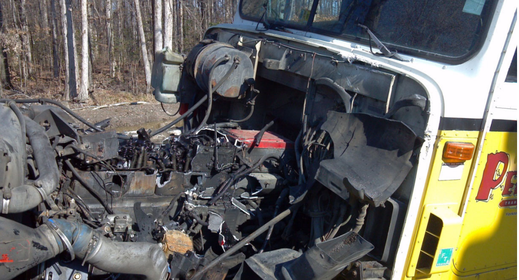
Example of visible destruction of the engine block