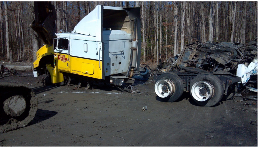
Example of chassis cut in half