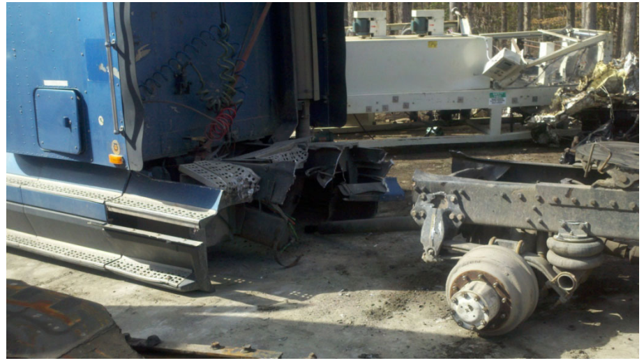
Example of chassis completely cut