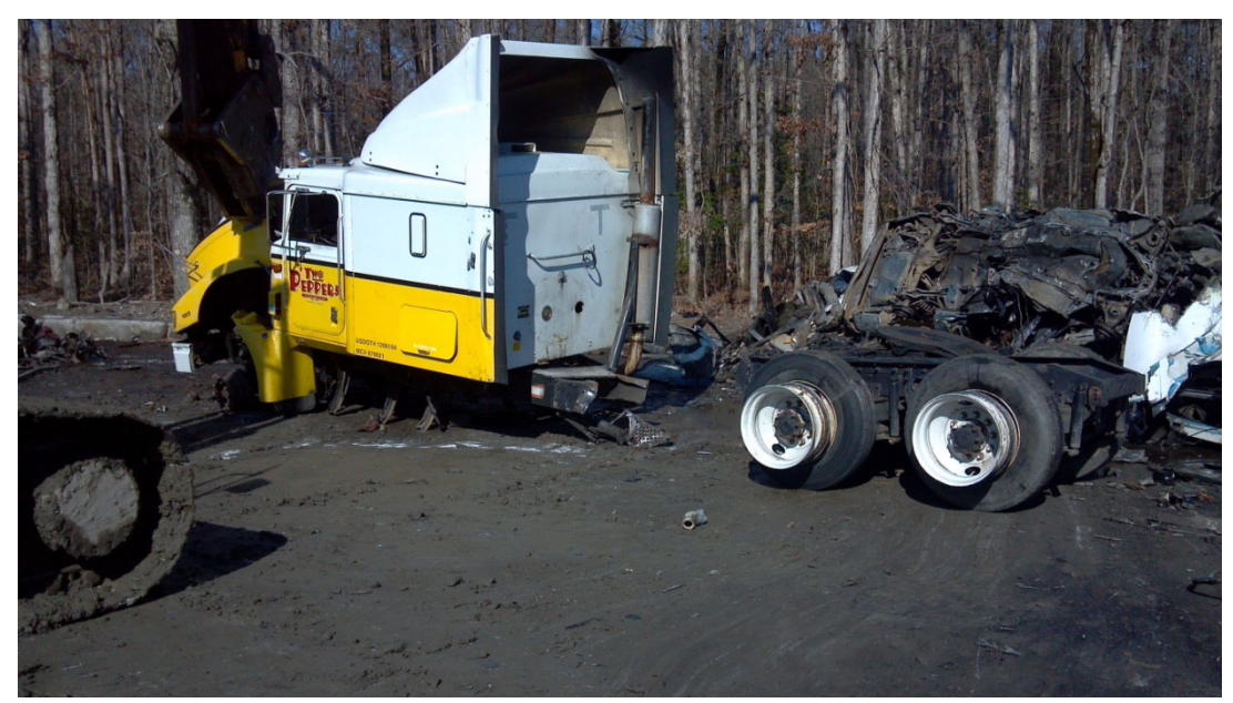
Example of chassis cut in half