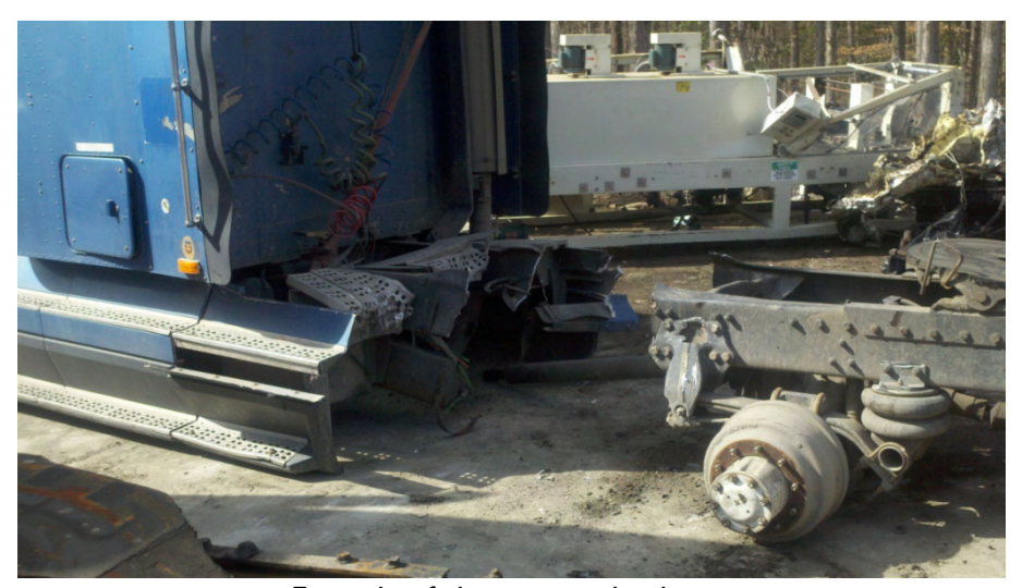
Example of chassis completely cut